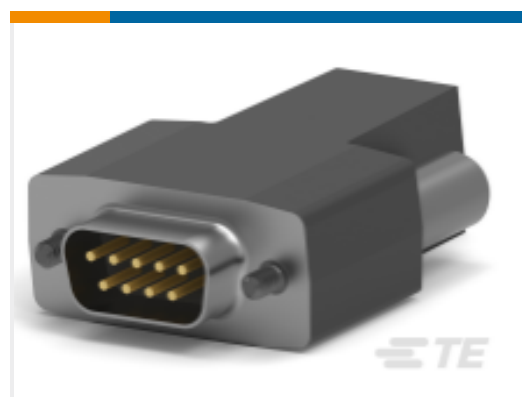
TE Part # 1-747944-6 KIT,PLUG,9P,HDE,SHLD ENCLSRE