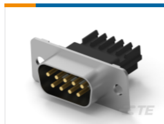
TE Part # 2-745492-0 PLUG ASSY,9P,HDE,MS